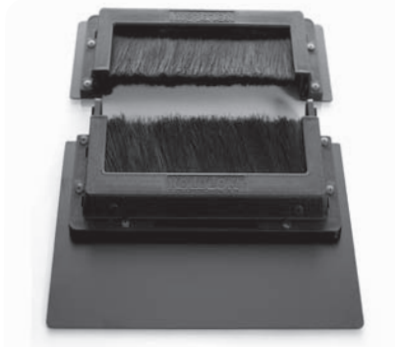
Item No. 2030