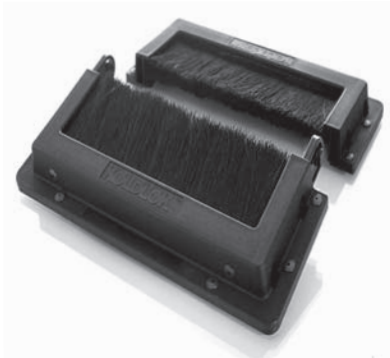
Item No. 2020