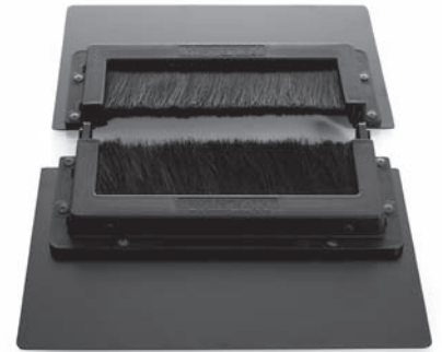
Item No. 2040